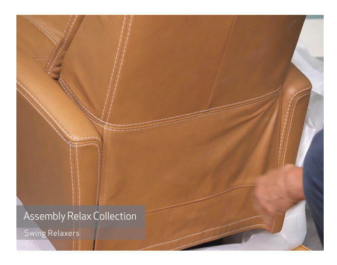
4. Tidy up the skirt and you are all set.

Once positioned, it is now time to attach the back seat cushion to the seat.